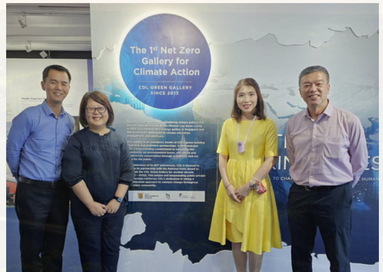
▲ AWiCS President and Vice-President attending the "Melting Ice, Sinking Cities" exhibition ▲