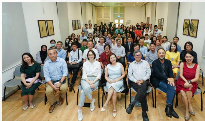
▲ Group Photo of all the attendees of the talk